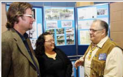
FACS Staff learn more about Aboriginal Culture.

In 2008, FACS and Niagara's Aboriginal community began to research and develop new ways to provide child protection services to Aboriginal children and their families that reflect and respect their culture, heritage and tradition. We are also working with the Francophone community to develop our capacity to provide French language services to families in Niagara.