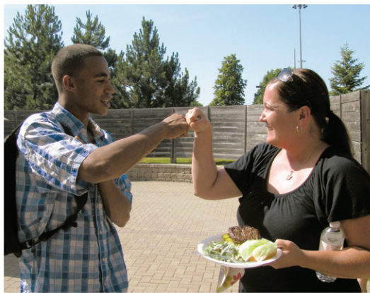
Staff and youth celebrate together at Home for the Holidays.

The Youth Advisory Committee gives youth a voice locally and provincially. Our youth helped develop a web site with The Niagara Crown Ward Championship Team, a partnership focused on educational outcomes for youth. They are also working on a presentation to educate their classmates about what it means to be “in care.” ■