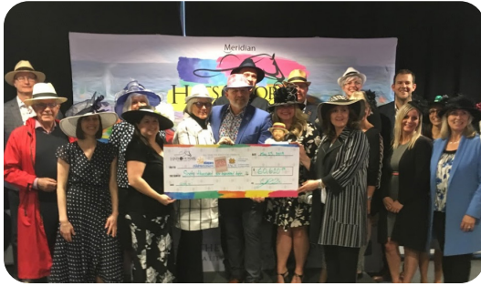
Leading the pack as the largest Kentucky Derby event outside of Churchill Downs, the second annual Hats & Horses event donated more than $20,000 to support the work of FACS Niagara in May 2019.