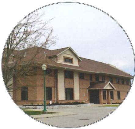
654 South Pelham Road Welland ON L3C 3C8