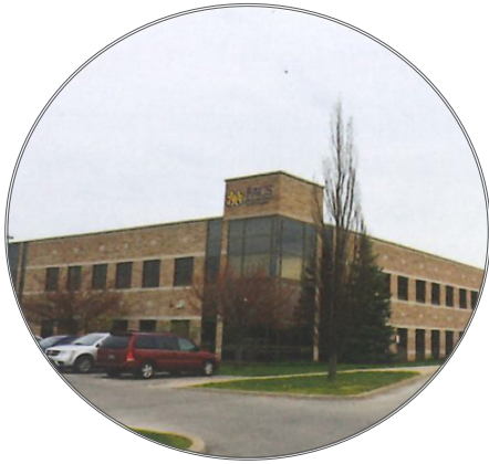
82 Hannover Drive St. Catharines ON L2W 1A4