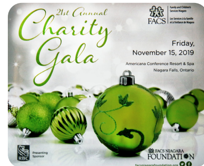
The RBC 21st Annual FACS Charity Gala raised more than $61,000 in November 2019 - the most ever - thanks to the generous support of sponsors, donors and guests.