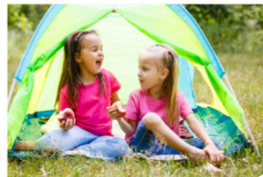
As COVID-19 closed camps in 2020, FACS and the Foundation launched, “Summer Smiles at Home;” providing toys, crafts and sports equipment so that children and youth could enjoy some summer fun in the safety of their own homes and backyards.