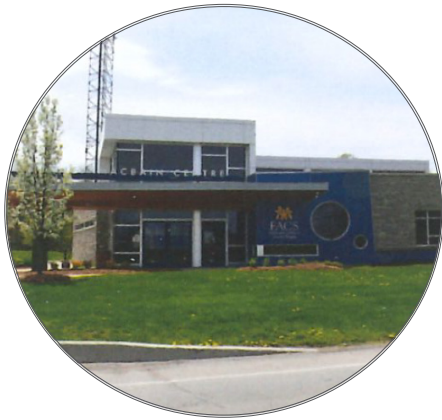
7900 Canadian Drive Niagara Falls ON L2E 6S5